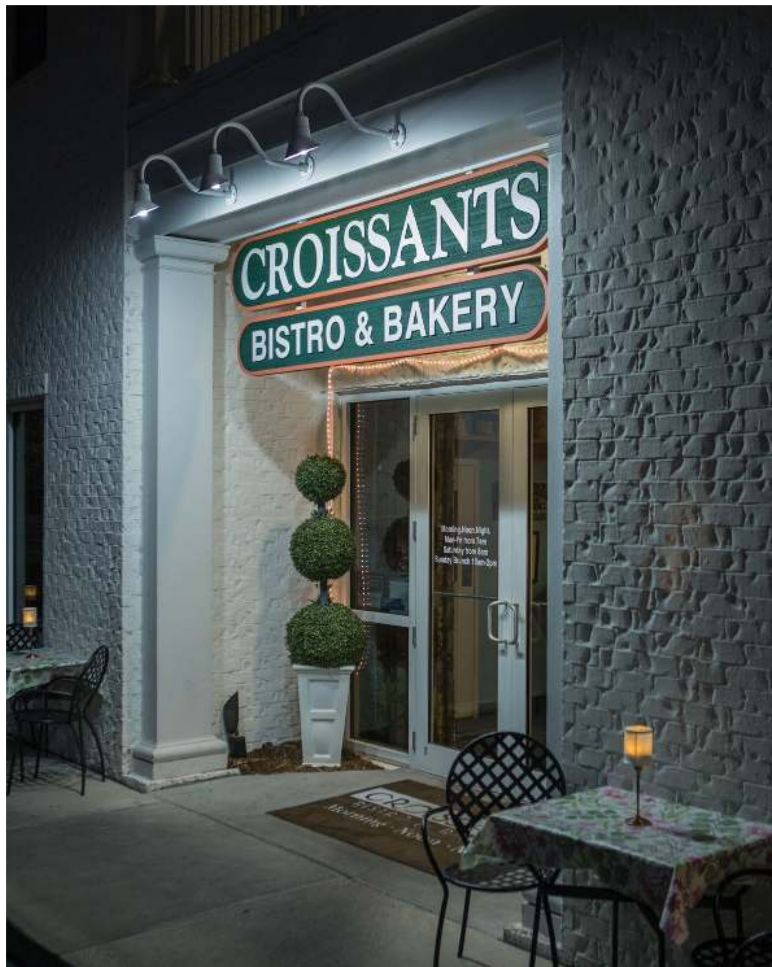
“Bonjour, y’all!” This popular slogan for Croissants Bistro & Bakery in Myrtle Beach, South