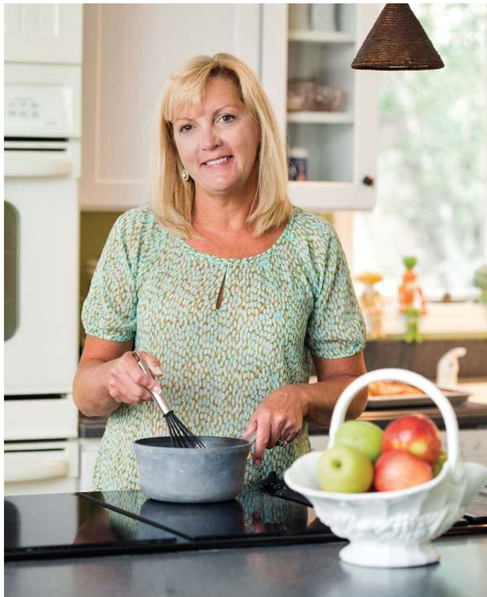
A TASTE OF THE OLD COUNTRY